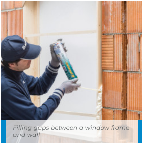
Filling gaps between a window frame and wall