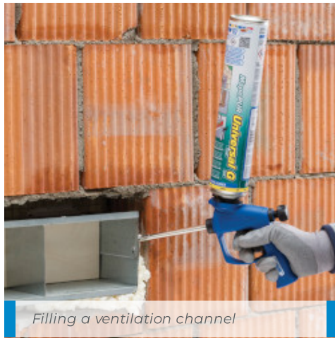
Filling a ventilation channel